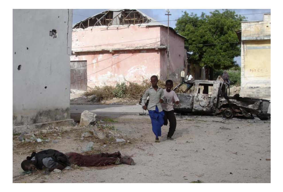
Children run past the body of a man, January 2009.

I don't lead a normal life for someone my age. Someone my age would have had an education and a family who cares for her. I live with a family and I get something to eat and a place to sleep. I'm afraid that if I leave this family whom I'm working for I may not get any better place."