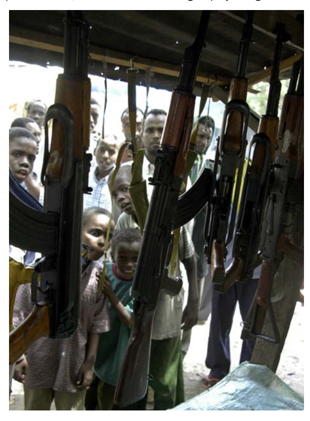
Weapons for sale at Bakara market, Mogadishu. May 2004

Parties to the conflict and other armed groups not detailed here, such as clan militia in specific areas or armed criminal gangs, have often overlapped, forged or shifted alliances, or suffered divisions over the past few years. There have been regular reports of defections between the main parties to the conflict, the TFG and al-Shabab. Defections have included members of the TFG security forces allegedly joining armed opposition groups after not being paid salaries, or factions of armed groups joining the TFG following grudges against their